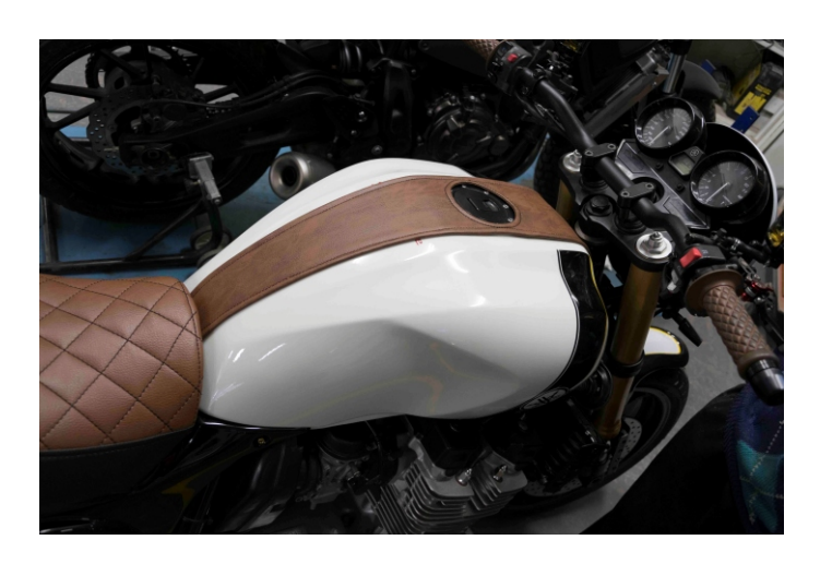
The end result should appear as in the photo Thank you for choosing one of our products.

Make the needed adjustments till the bib gets in place and tighten everything when finished.