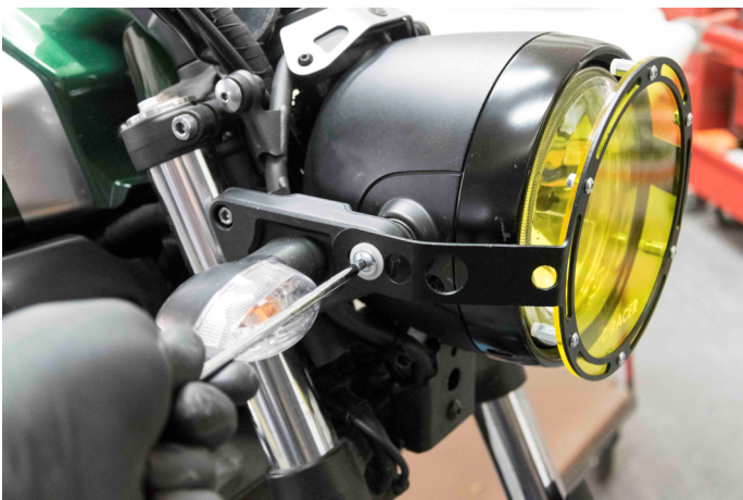
Place the grill and slide through the new screws with the washers – you should adjust the grill's position before tightening all the screws. You may undo the plastic screws if you wish so that they almost fall on the perimeter of the headlight.