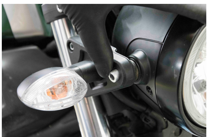
Place the headlight in position and put the small adaptors on both outer sides of the headlight –you will need to hold it in place with your hand until you put on the grill as well.