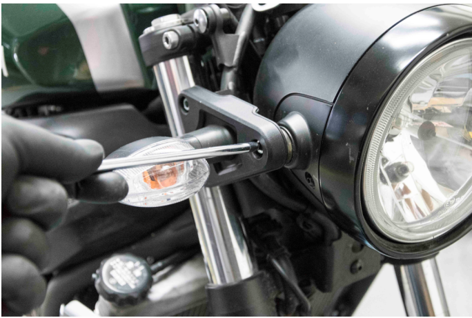
Undo the side screws of the headlight.