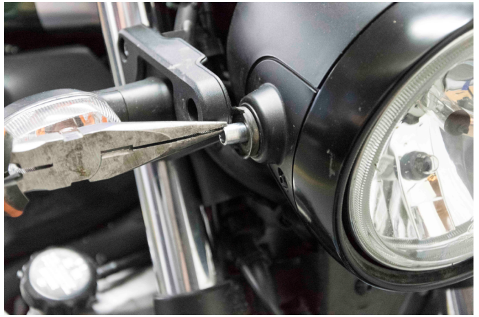
On the inner side of the headlight, remove the thread that's holdin it in place. You can do it by using the old screw to pull it out.