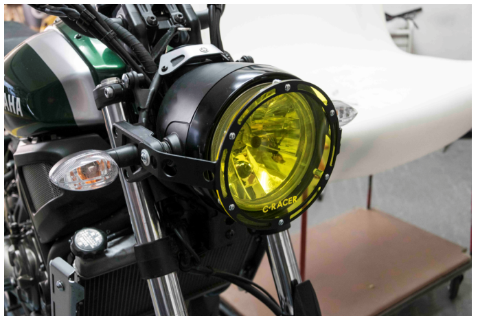
The end result should appear as in the photo above. Thank you for choosing one of our products. You may watch the installation video at the following link: https://youtu.be/k1tVLI7nMAK