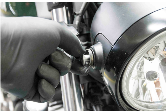
Put on the new adaptors in place of the old ones.